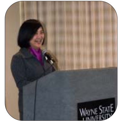
Above: Keynote Speaker Rey Chow, Brown University

responses to such issues as immigration and religious tolerance, global anti-Americanism and increasing terrorism.