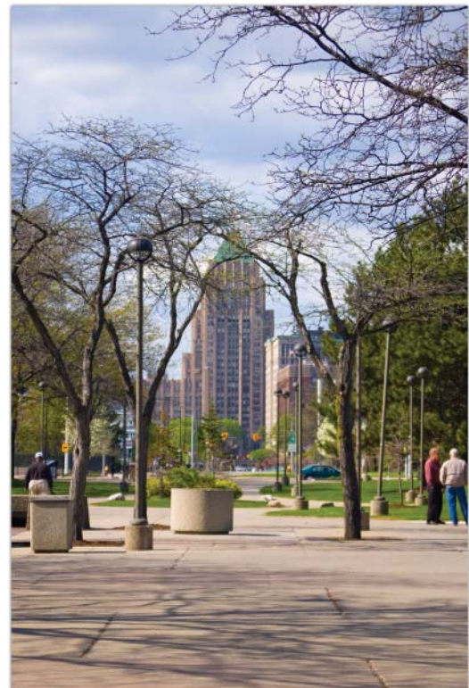
View of the Fischer Building from Wayne State Campus