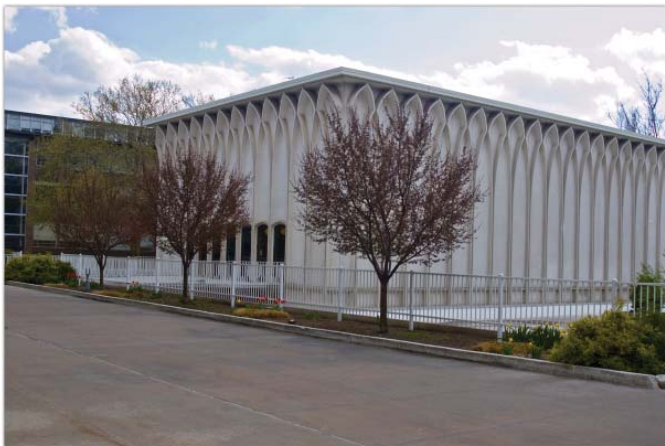
Helen L. DeRoy Auditorium

Working Groups meet regularly throughout the year for scholarly interaction as well as to plan special events such as guest lectures and colloquia. This year, the Center supported Working Groups by scheduling meeting space and providing up to $800 for speakers, supplies, or other organizational needs. The following reports were received from supported Working Groups.