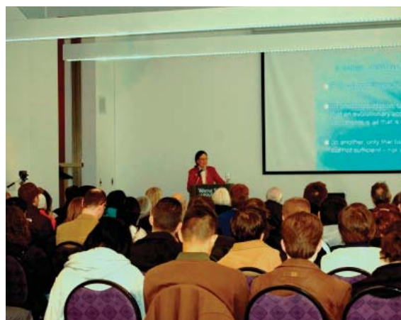
Keynote speaker Susan Haack from the University of Miami, presenting her lecture Six Signs of Scientism & Three Thoughts about the Climate of Climate Research , at the Humanities Center's Faculty Fellow's Conference on The Environment .