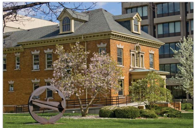
Fine, Performing & Communication Arts, Frederick Linsell House